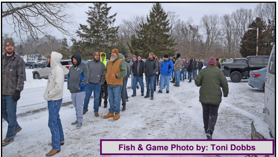
Fish & Game